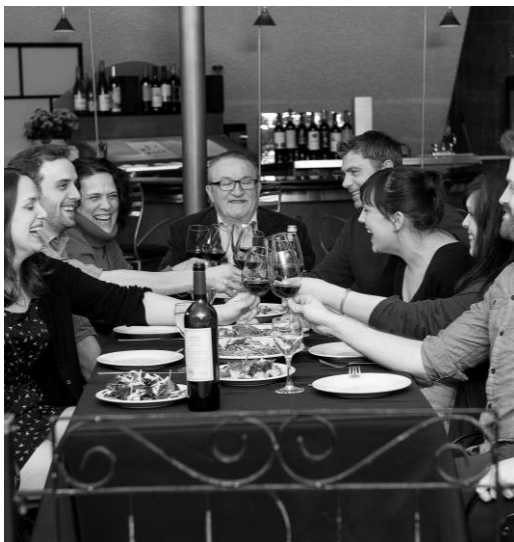
The Zenari family at the wine bar.